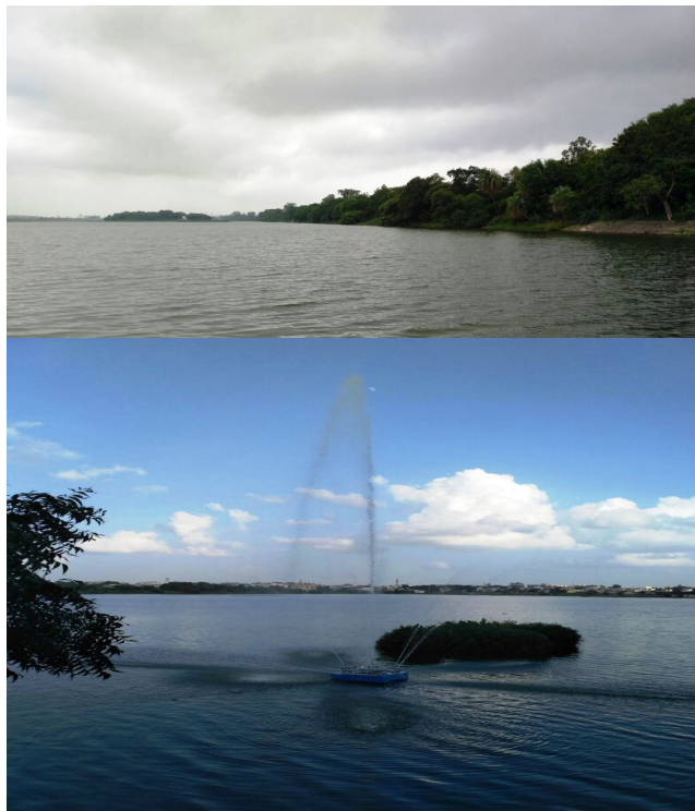
Figure-1: Sirpur Lake Indore.

the vicinity of lake. Because of such industrialization it causes massive killing of fish since from last few decades and birds continue to decline from this lake. Therefore we need to protect the quality of lake water so that it can be used for different purposes like drinking, domestic, irrigation, industrial and recreational purposes.